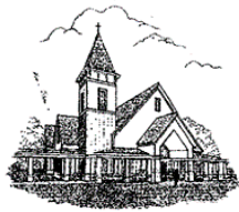
HOLY FAMILY PARISH ALTAR SOCIETY