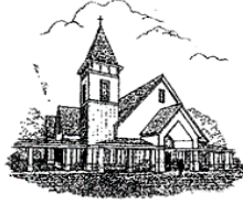
HOLY FAMILY PARISH ALTAR SOCIETY