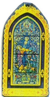
#4 (Flight into Egypt)

AVAILABLE FOR ORDER THROUGH SEPTEMBER 16th.