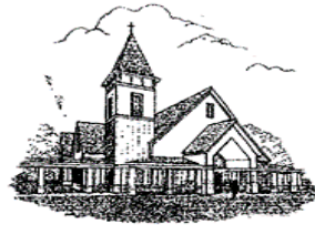
HOLY FAMILY PARISH ALTAR SOCIETY

Wednesday, September 4th 10:00 am Church Multi Purpose Room